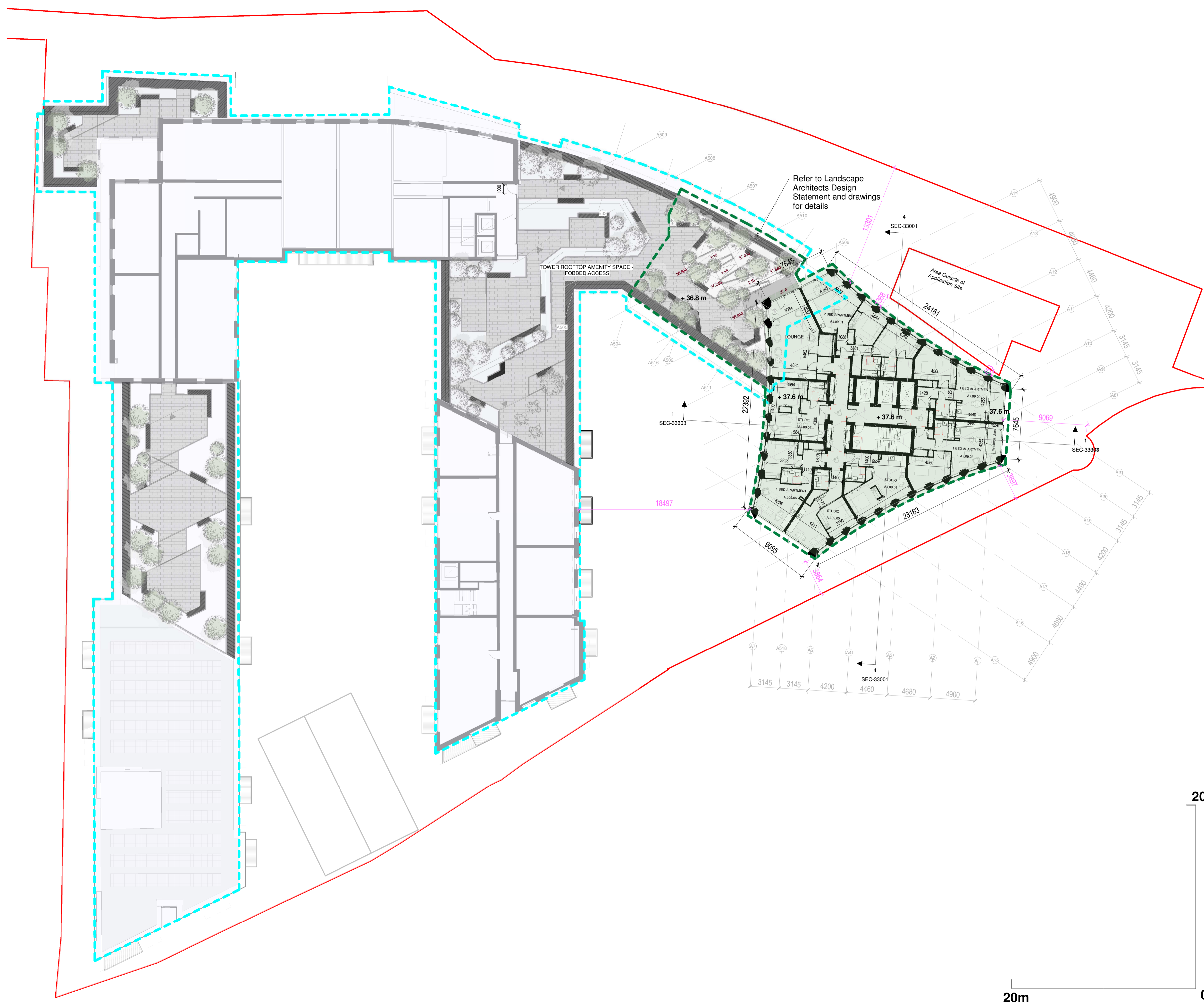
Proposed 9th Floor Plan 1 : 200